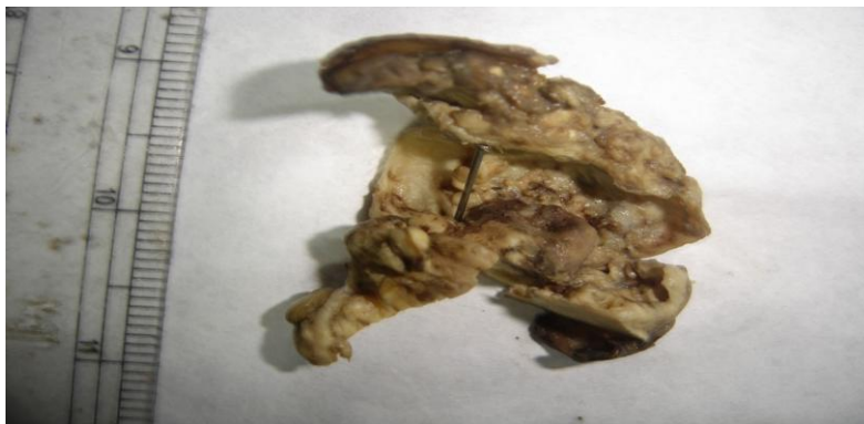
Figure 1: Image shows the gross picture of the gallbladder specimen in a case tuberculous cholecystitis.